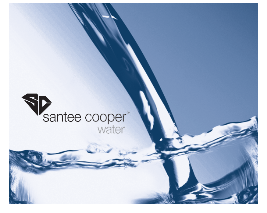
We're pleased to report that your water is safe and meets all federal and state requirements.

We are proud that your drinking water meets or exceeds all federal and state requirements. We have learned through our monitoring and testing that some constituents have been detected. The EPA has determined that your water IS SAFE at these levels.